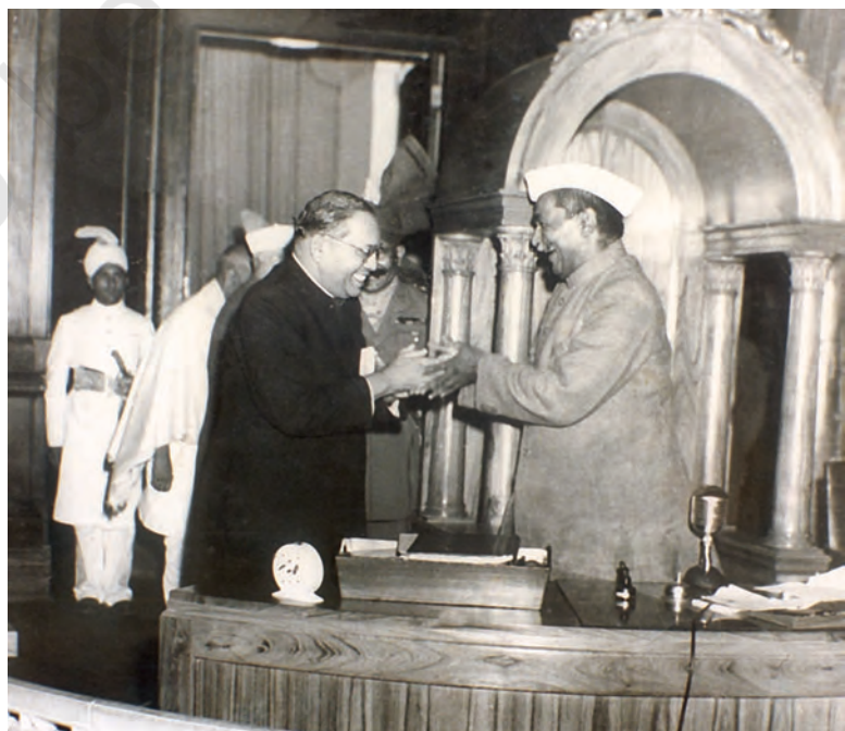
Fig. 12. 9 B. R. Ambedkar and Rajendra Prasad greeting each other at the time of the handing over of the Constitution

The Constituent Assembly debates help us understand the many conflicting voices that had to be negotiated in framing the Constitution, and the many demands that were articulated. They tell us about the ideals that were invoked and the principles that the makers of the Constitution operated with. But in reading these debates we need to be aware that the ideals invoked were very often re-worked according to what seemed appropriate within a context. At times the members of the Assembly also changed their ideas as the debate unfolded over three years. Hearing others argue, some members rethought their positions, opening their minds to contrary views, while others changed their views in reaction to the events around.