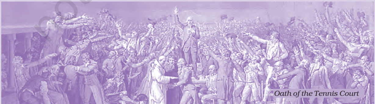
Oath of the Tennis Court

CONSTITUENT ASSEMBLY DEBATES (CAD), VOL.I