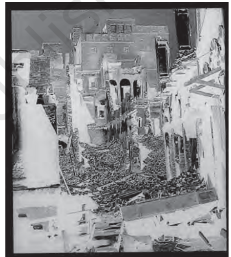
Fig. 12.2 Images of desolation and destruction continued to haunt members of the Constituent Assembly.

On Independence Day, 15 August 1947, there was an outburst of joy and hope, unforgettable for those who lived through that time. But innumerable Muslims in India, and Hindus and Sikhs in Pakistan, were now faced with a cruel choice – the threat of