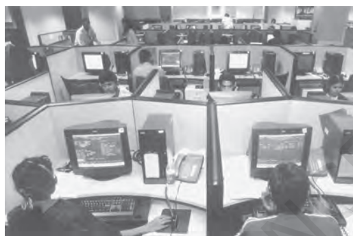
Fig. 3.2 IT industry is seen as a major contributor to India's exports

Some scholars question the usefulness of India being a member of the WTO as a major volume of international trade occurs among the developed nations. They also say that while developed countries file complaints over agricultural subsidies given in their countries, developing countries feel cheated as they are forced to open their markets for developed countries but are not allowed access to the markets of developed countries. What do you think?