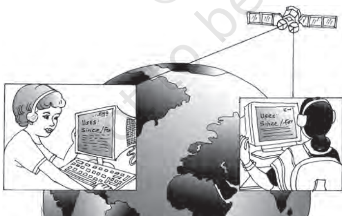
Fig. 3.1 Outsourcing: a new employment opportunity in big cities

global trade organisation to administer all multilateral trade agreements by providing equal opportunities to all countries in the international market for trading purposes. WTO is expected to establish a rule-based trading regime in which nations cannot place arbitrary restrictions on trade. In addition, its purpose is also to enlarge