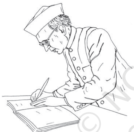
Jawaharlal Nehru CAD, Vol. VI, p. 734

"We did not give him any real power but we have made his position one of authority and dignity. The constitution wants to create neither a real executive nor a mere figurehead, but a head that neither reigns nor governs; it wants to create a great figurehead..."