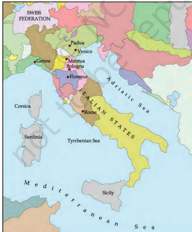
MAP 1: The Italian States

With the expansion of trade between the Byzantine Empire and the Islamic countries, the ports on the Italian coast revived. From the twelfth century, as the Mongols opened up trade with China via the Silk Route (see Theme 5) and as trade with western European countries