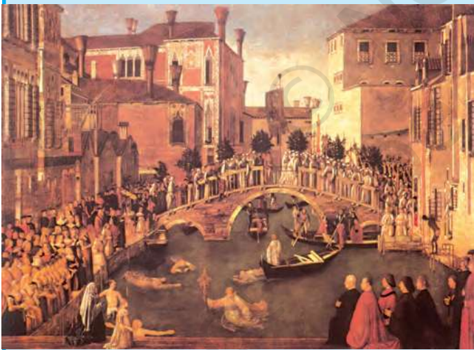
G. Bellini's 'The Recovery of the Relic of the Holy Cross' was painted in 1500, to recall an event of 1370, and is set in fifteenth-century Venice.

this company of citizens, in whose authority [lies] the whole power of the commonwealth... Because many troubles and popular tumults arise in those cities, whose government is swayed by the common people... many were of contrary opinion, deeming that it would do well, if this manner of governing the commonwealth should rather be defined by ability and abundance of riches. Contrariwise the honest citizens, and those that are liberally brought up, oftentimes fall to poverty... Therefore our wise and prudent ancestors... ordered that this definition of the public rule should go rather by the nobility of