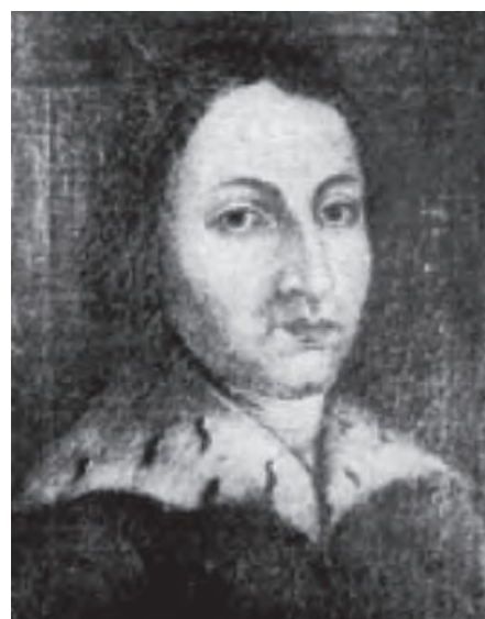
Self-portrait by Copernicus.

Celestial means divine or heavenly, while terrestrial implies having a worldly quality.