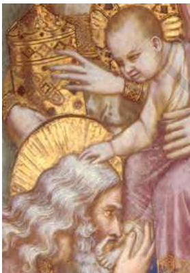
Giotto's painting of the child Jesus, Assisi, Italy.

to be known because of Dante Alighieri (1265-1321), a layman who wrote on religious themes, and Giotto (1267-1337), an artist who painted lifelike portraits, very different from the stiff figures done by earlier artists. From then it developed as the most exciting intellectual city in Italy and as a centre of artistic creativity. The term 'Renaissance Man' is often used to describe a person with many interests and skills, because many of the individuals who became well known at this time were people of many parts. They were scholar-diplomat-theologian-artist combined in one.