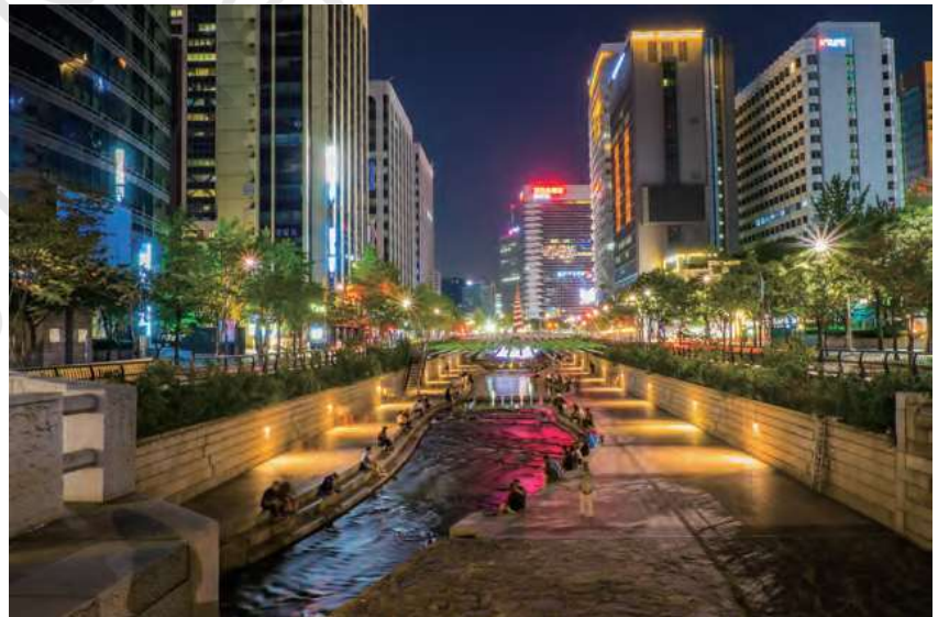
Present-day downtown Seoul at night.

In December 1997, long-time opposition party leader Kim Dae-jung was elected the president for the first time in Korea, marking a peaceful transfer of power. The second peaceful transfer of power came in 2008, when conservative Lee Myung-bak was elected as the president, following the progressive Roh Mu-hyun administration. In 2012, conservative Park Geun-hye was elected as the first female president. At the beginning of her presidency, she gained support due to the political legacy of her father, Park Chung-hee. But in October 2016, as it came to light that she had let a friend secretly manage government affairs, she met with nationwide protests, leading to her impeachment and removal from office in March 2017. In May 2017, Moon Jae-in was elected the president, in a peaceful transfer of power for the third time.