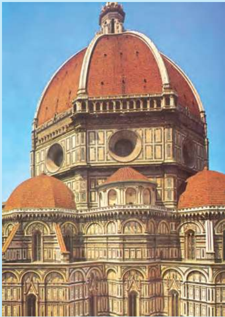
The Duomo, the dome of Florence cathedral designed by Brunelleschi.

Another remarkable change was that from this time, artists were known individually, by name, not as members of a group or a guild, as earlier.