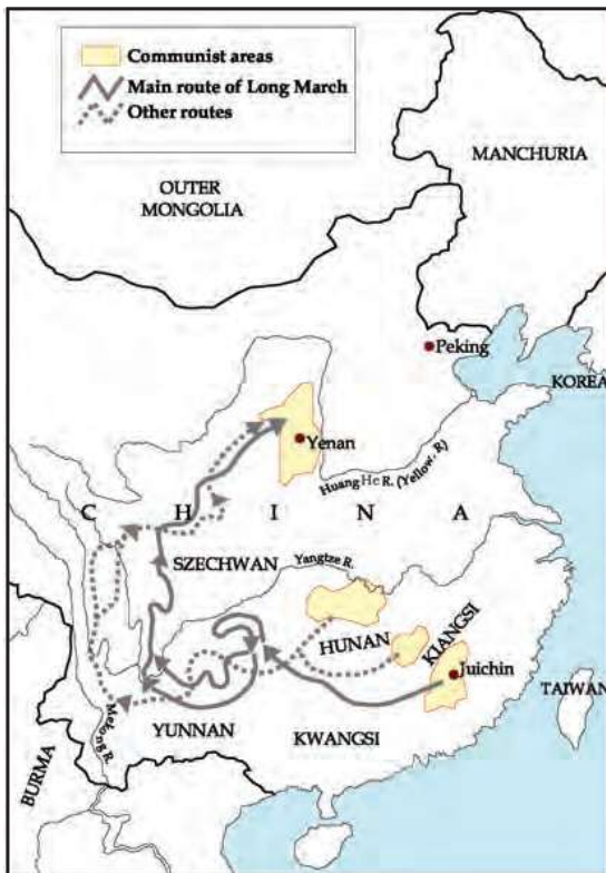
MAP 2: The Long March

Photograph of soldiers on the Long March reclaiming wasteland, 1941.