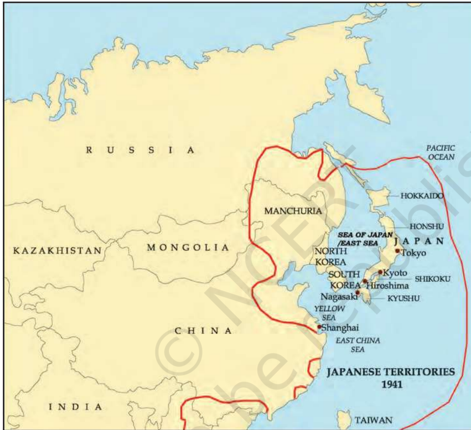
MAP 1: East Asia

China and Japan present a marked physical contrast. China is a vast continental country that spans many climatic zones; the core is dominated by three major river systems: the Yellow River (Huang He), the Yangtse River (Chang Jiang – the third longest river in the world) and the Pearl River. A large part of the country is mountainous.