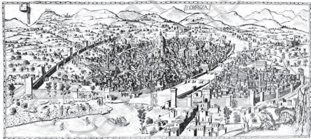
Florence, a sketch made in 1470.

to be known because of Dante Alighieri (1265-1321), a layman who wrote on religious themes, and Giotto (1267-1337), an artist who painted lifelike portraits, very different from the stiff figures done by earlier artists. From then it developed as the most exciting intellectual city in Italy and as a centre of artistic creativity. The term 'Renaissance Man' is often used to describe a person with many interests and skills, because many of the individuals who became well known at this time were people of many parts. They were scholar-diplomat-theologian-artist combined in one.