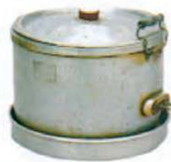
The novelty of electric goods: a rice-cooker, an American grill, a toaster.

housing available for a down payment of 200 yen and a monthly instalment of 12 yen for ten years – this at a time when the salary of a bank employee (a person with higher education) was 40 yen per month.