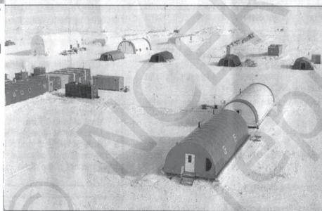
The research station for the European Project for Ice Coring in Antarctica.