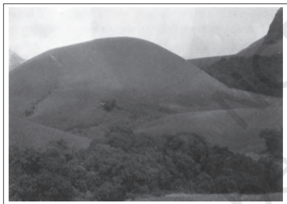
Figure 14.1 : Grasslands and sholas in Indira Gandhi National Park, Annamalai, Western Ghats — an example of ecosystem diversity

You have studied about the ecosystem in the earlier chapter. The broad differences between ecosystem types and the diversity of habitats and ecological processes occurring within each ecosystem type constitute the ecosystem diversity. The 'boundaries' of communities (associations of species) and ecosystems are not very rigidly defined. Thus, the demarcation of ecosystem boundaries is difficult and complex.