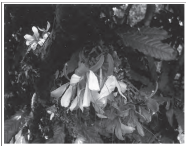
Figure 14.3 : Humboldtia decurrens Bedd — highly rare endemic tree of Southern Western Ghats (India)

There is an urgent need to educate people to adopt environment-friendly practices and reorient their activities in such a way that our development is harmonious with other life forms and is sustainable. There is an increasing consciousness of the fact that such conservation with sustainable use is possible only with the involvement and cooperation of local communities and individuals. For this, the development of institutional structures at local levels is necessary. The critical problem is not merely the conservation of species nor the habitat but the continuation of process of conservation.