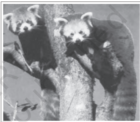
Figure 14.2 : Red Panda — an endangered species

It includes those species which are in danger of extinction. The IUCN publishes information about endangered species world-wide as the Red List of threatened species.